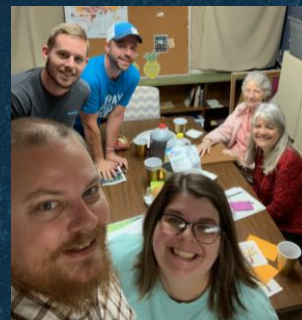
Our CCSM Leaders are what make student ministries happen. We would love to have you on our team!